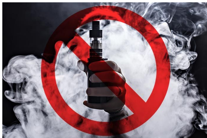
Stop Vaping. picture link

Let's talk about it. You will be short of breath, have mouth and throat irritation, coughing and wheezing, chest pain, rapid heartbeat and blood pressure, lung cancer, death, and PLENTY more horrible symptoms so the next time you think about getting a vape remember all the faults of it.