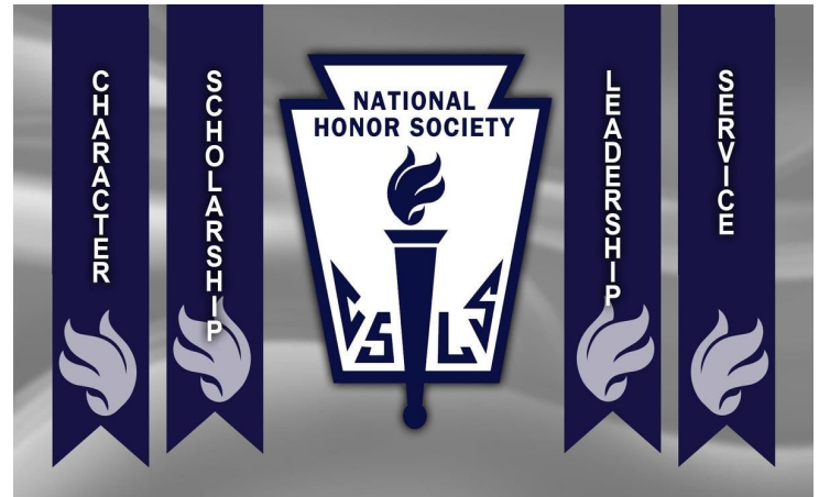
National Honor Society. picture link