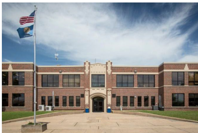
Picture of Holdenville High School.

Do you enjoy teaching here at Holdenville?