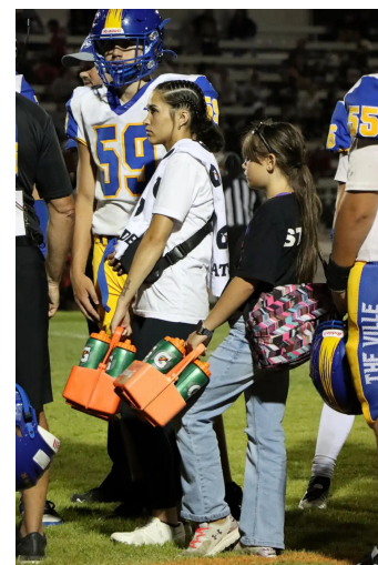
Wolverine Trainers.

The Junior High Wolverines have a week off. They will play their next game here, in Holdenville, against Wewoka at 6:00 p.m.