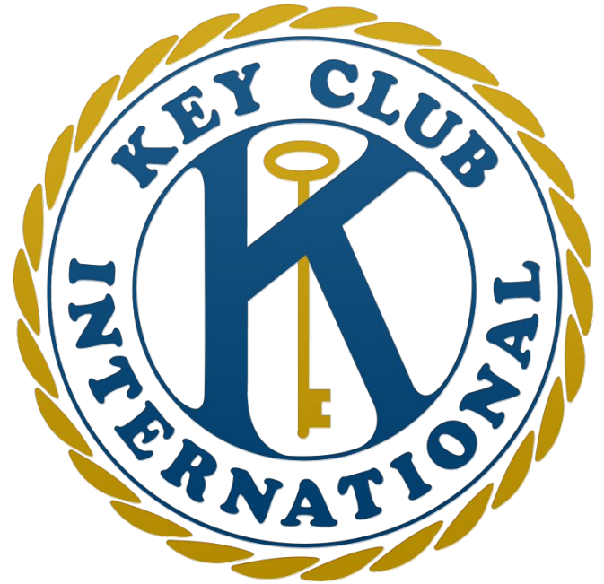
Key Club Logo. Found here.